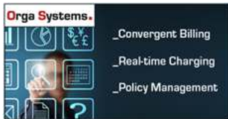
Figure 5.8 5G network latest technology

Wireless technology has changed the mean of communication .business industry are running and highly progressed because of the wireless network. It is now more suitable for the business because of its awesome features like speed, security, mobility, and Wi-Fi hotspot. Voice application can be successfully running because of the wireless network. By using this you can easily access the internet with high speed and including text, audio, video messages, and many more things become easier due to the wireless network.