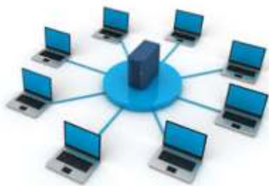
Figure 4.1: Diagram of Wired Network

The word wired [12] refers to any kind of physical medium which is consisting of the cable. The cables made up of the copper, fiber optics, and twisted pair. Wired network is mostly used to carry different types of signals in the form of electricity from one medium to another. In a wired network, only one internet connection is used in the cable. Only one device is attached to one internet cable and data is shared among the different devices by using this same concept of wire network.