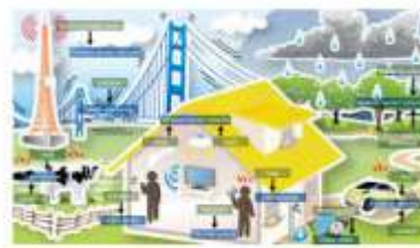
Figure5.3. open source Wi-Fi usage