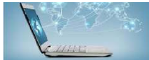
Figure 5.7. Wi-Fi advance technology