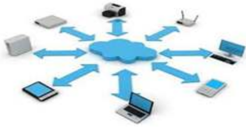
Figure 5: Diagram of the Wireless Network