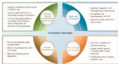
Figure No 2: Fusion Sphere Advantages