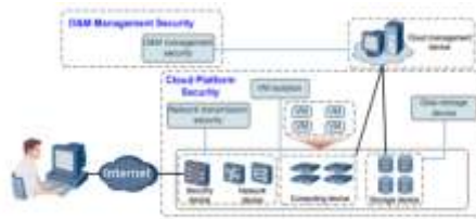
Figure No 3: virtualization platform structure

Huawei provides the virtualization platform security solution to face the threats and challenges posed to the cloud computing system.