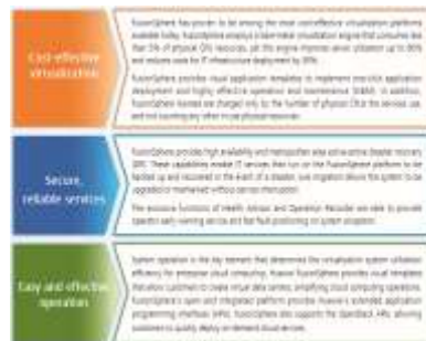
Figure No 4: Proven Success of Fusion Sphere

Huawei Fusion Sphere has served clients in 42 nations and locales around the world, covering fields going from government and open utilities to broadcast communications, vitality, finance, transportation, social insurance, instruction, media, producing and different enterprises. FusionSphere enables clients to incorporate and enhance their server farms and administration stages, enhancing framework dependability and IT efficiency [5][6].